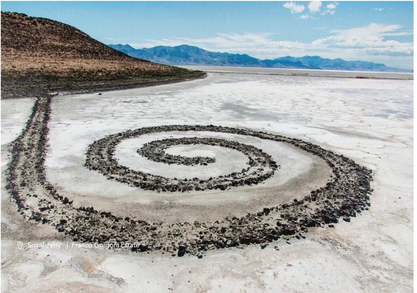
📍 Spiral Jetty