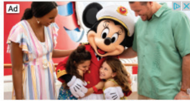
A family adventure