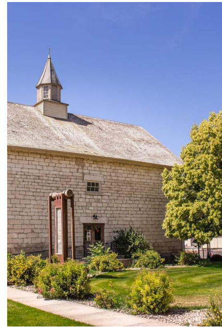
Granary Arts Building in Ephraim

The Snow College Art Gallery presents an annual exhibition of works from teachers, students and the community, and offers space for critique and discussion. Annual showcases include Artists in Residence, a juried exhibition of student work, and a bi-annual faculty exhibition, with solo and group shows throughout the year. The gallery also houses the Snow College Permanent Collection, including the Lund-Wassmer Collection, works donated by patrons and new acquisitions.