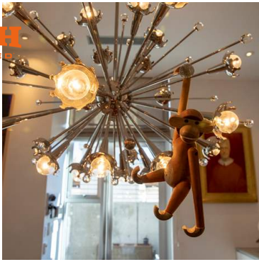
Anne Jespersen Fine Arts