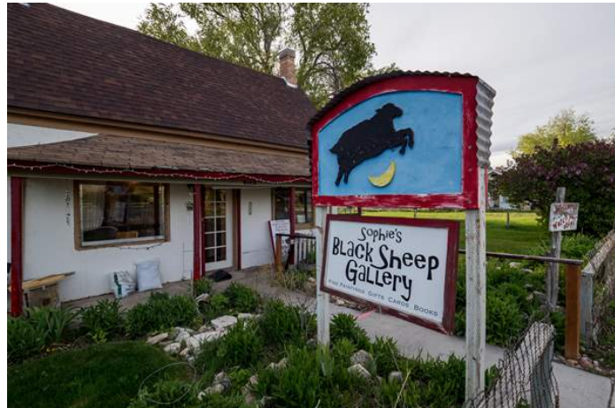
Sophie's Black Sheep Gallery in Spring City