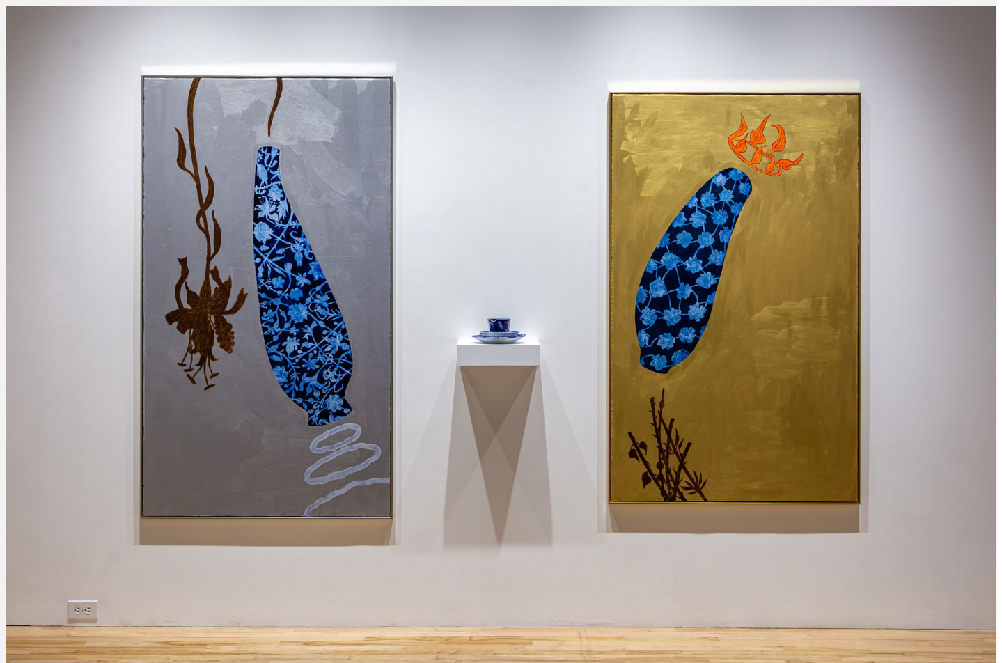
Installation view of Chiasma at Granary Arts, left to right: "Smoke Rings," 2022, acrylic on paper mounted on wood panel; "Ring of Fire," 2022, acrylic on paper mounted on wood panel Granary Arts installation view of Chiasma, photo by Kamilla Earlywine

The crockery is translucent white with ultramarine blue floral patterns often seen in Chinese and Dutch ceramics. The patterns on the cup and saucer are similar but not identical to what is seen in the paintings. The physical dishes served as inspiration for Wilson, and their presence seem to function as support artifacts in a museum rather than organic to the exhibition. Because of the scale of the paintings, the singularity of the ceramic pieces, and the location at the middle of the featured wall, these pieces are the centerpiece of the exhibition, but are its least engaging elements.