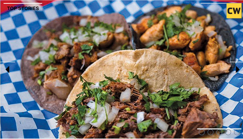
RESTAURANT REVIEW: TRADITIONAL MEXICAN FARE AT HOUSE OF CORN