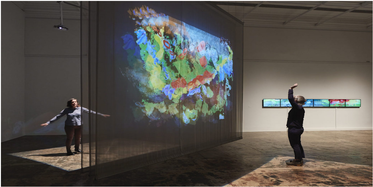
Installation view: Camille Utterback "Entangled" in Bright Golden Haze