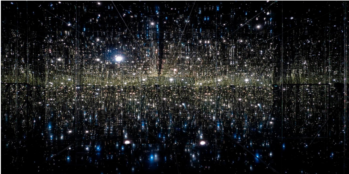
Yayoi Kusama, “Where the Lights in My Heart Go” (2016). Stainless steel and aluminum, 118 1/8 x 118 1/8 x 118 1/8 inches (collection of Lauren and Derek Goodman, courtesy Ota Fine Arts and Victoria Miro. Copyright Yayoi Kusama, photo by Simon Klein)

Hall Denver, a relative newcomer to the Colorado arts scene, is a little late to be categorically “spring” but still a must-see if you’re in the Denver area.