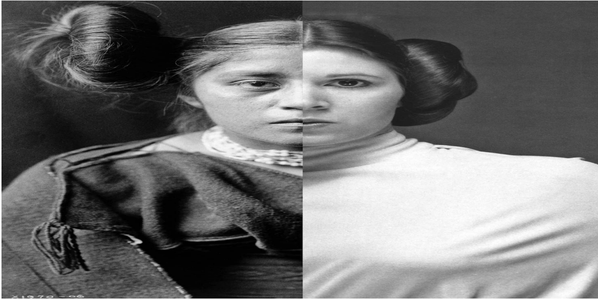
Nicholas Galanin, "Things Are Looking Native, Native's Looking Whiter," (2012). Digital print, 20.42 x 14.67 inches