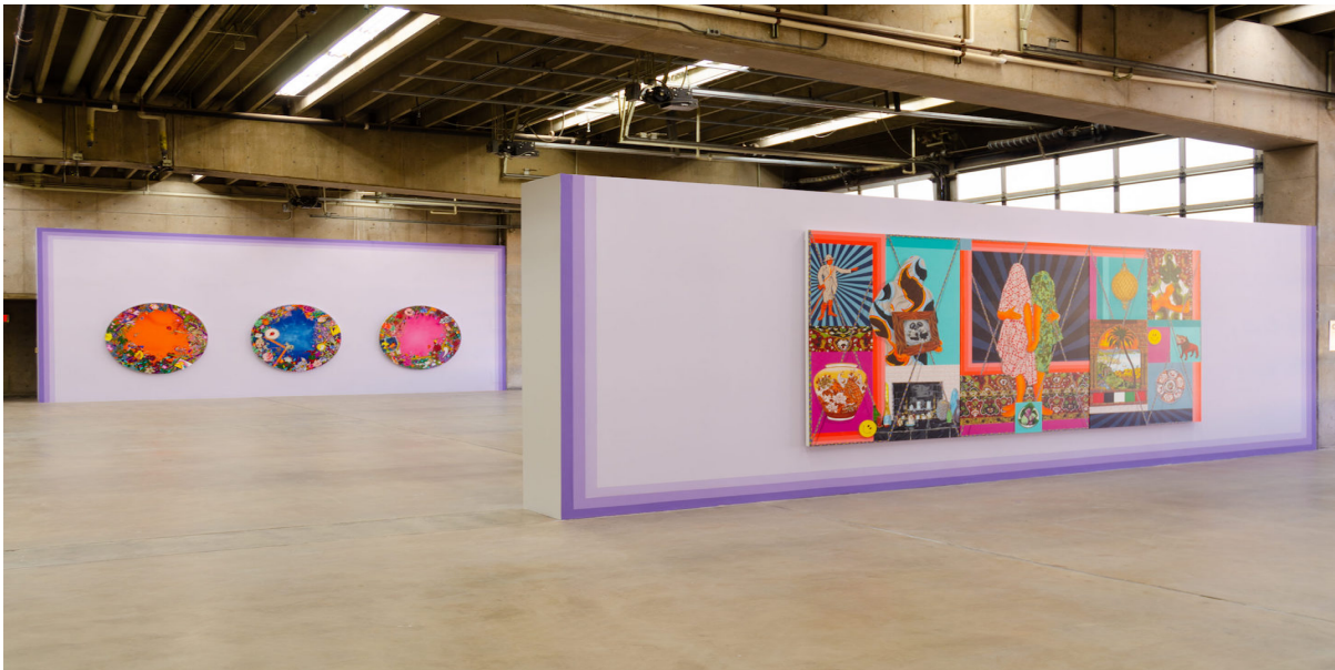
Installation view of Amir Fallah: Scatter My Ashes on Foreign Lands at MOCA Tucson